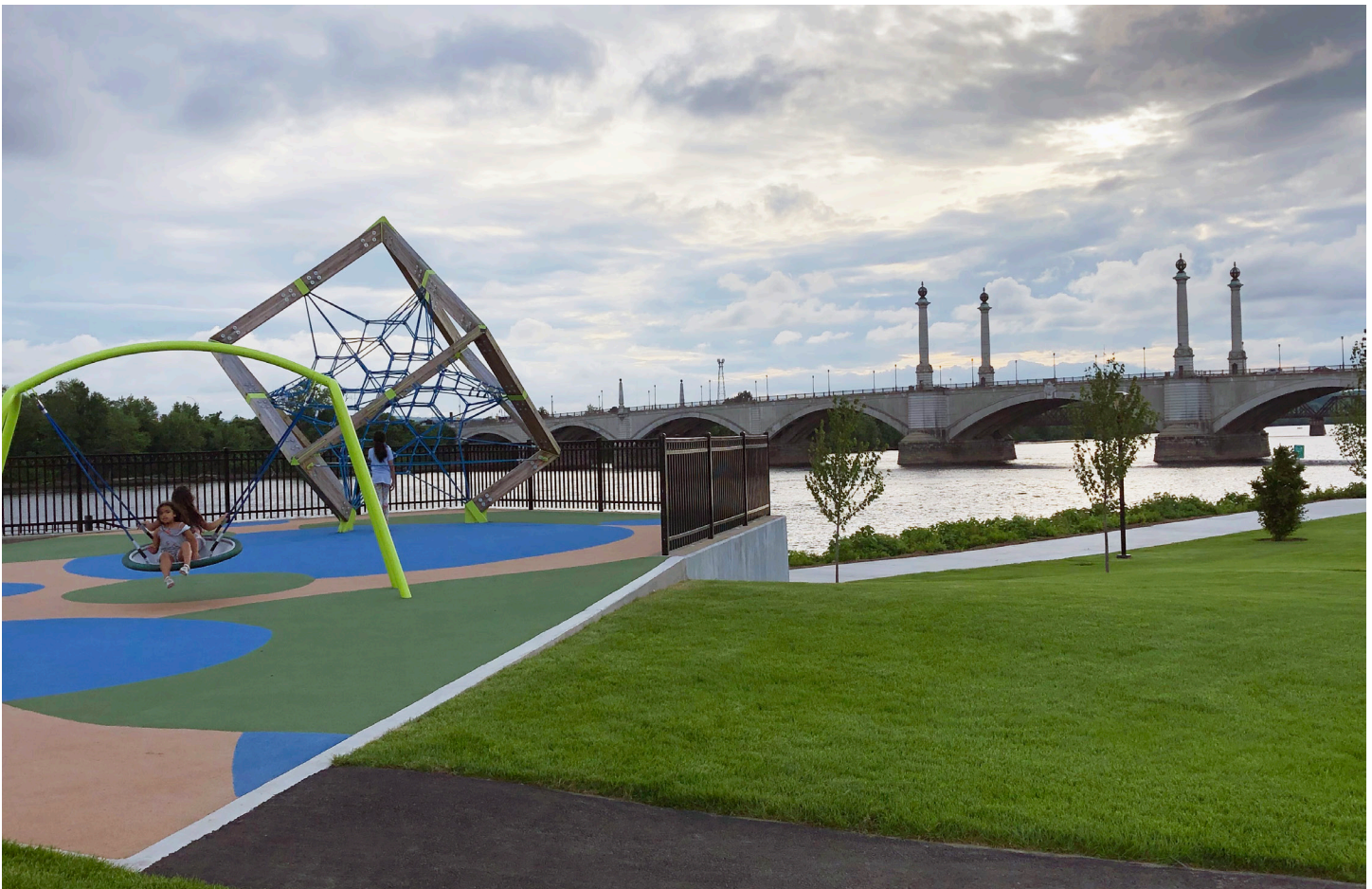
Riverfront Park with Memorial Bridge in the background.

Identify Areas and Facilities with Special Environmental Sensitivity